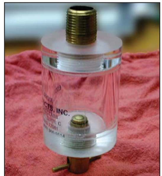
Figure 2. BS&W bowl (Before)