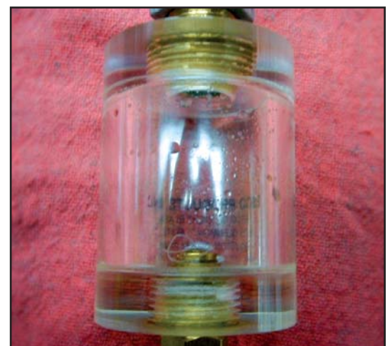
Figure 3. BS&W bowl (After)