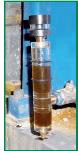
Pulp & Paper Mill