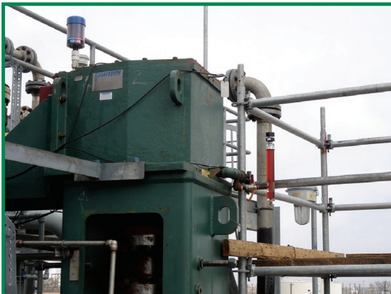
Chemical Processing Plant