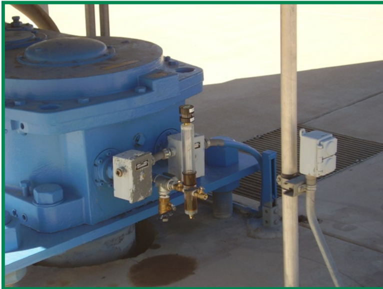
Wastewater Treatment Plant